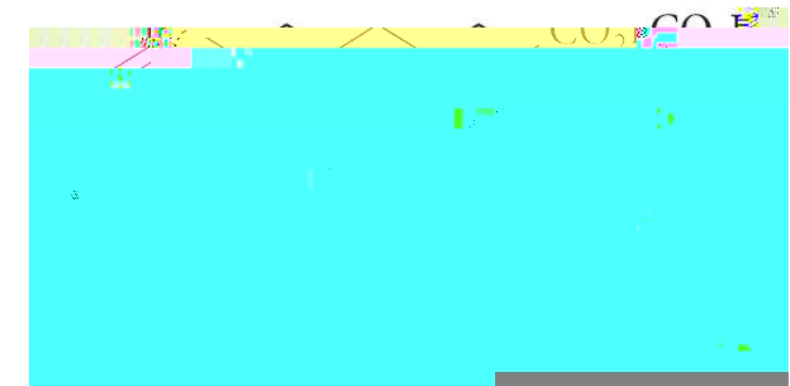
Figure 3. Levodopa chemical structure. (Abdoon, 2022)

and remains in the body for longer than IR-CL. The increased on time of ER-CL is linked to increased nausea compared to IR-CL. Due to these factors IR-CL seems to be the better option in early Parkinson's Disease and ER-CL for later.